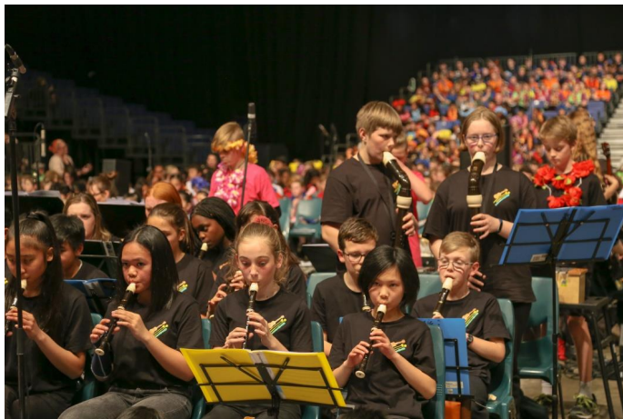
Recorders in action at the Strum Strike and Blow 2019